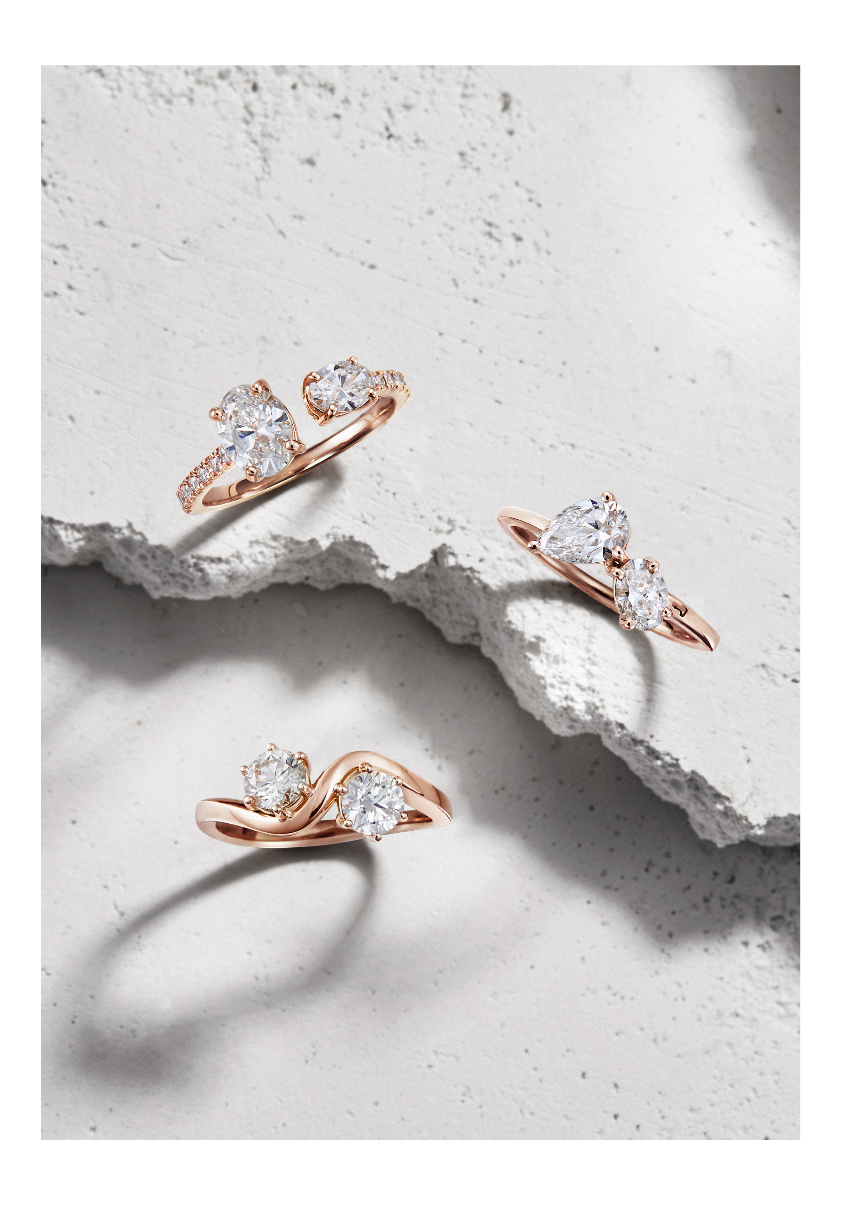
Oval cut diamonds with diamonds on the band in 18k rose gold Round brilliant diamonds in 18k rose gold Pear-shaped and oval cut diamond in 18k rose gold