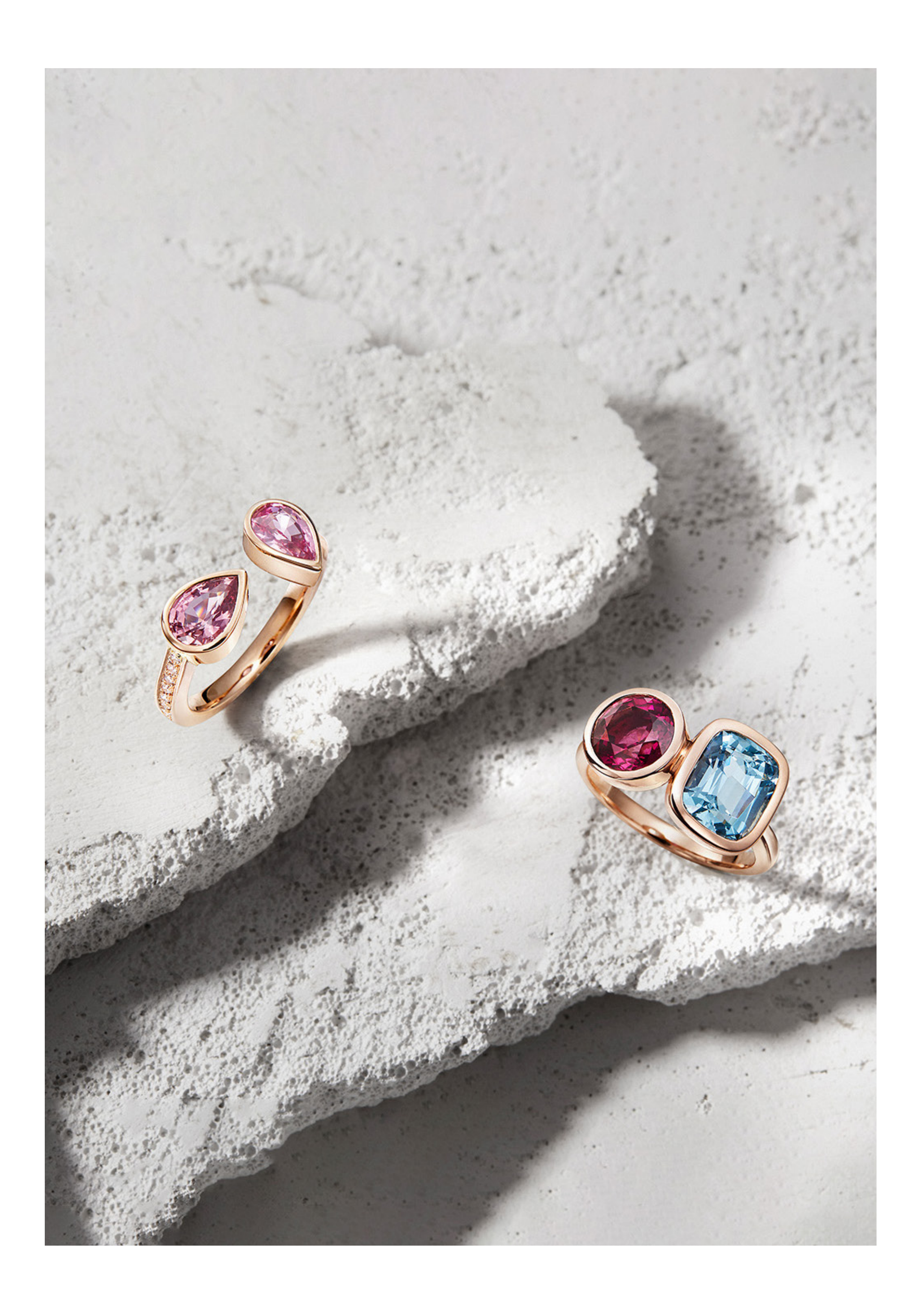
Fancy pear-shaped spinels with diamonds on the band in 18k rose gold

Unheated cushion Madagascar aquamarine and round rhodolite garnet in 18k rose gold