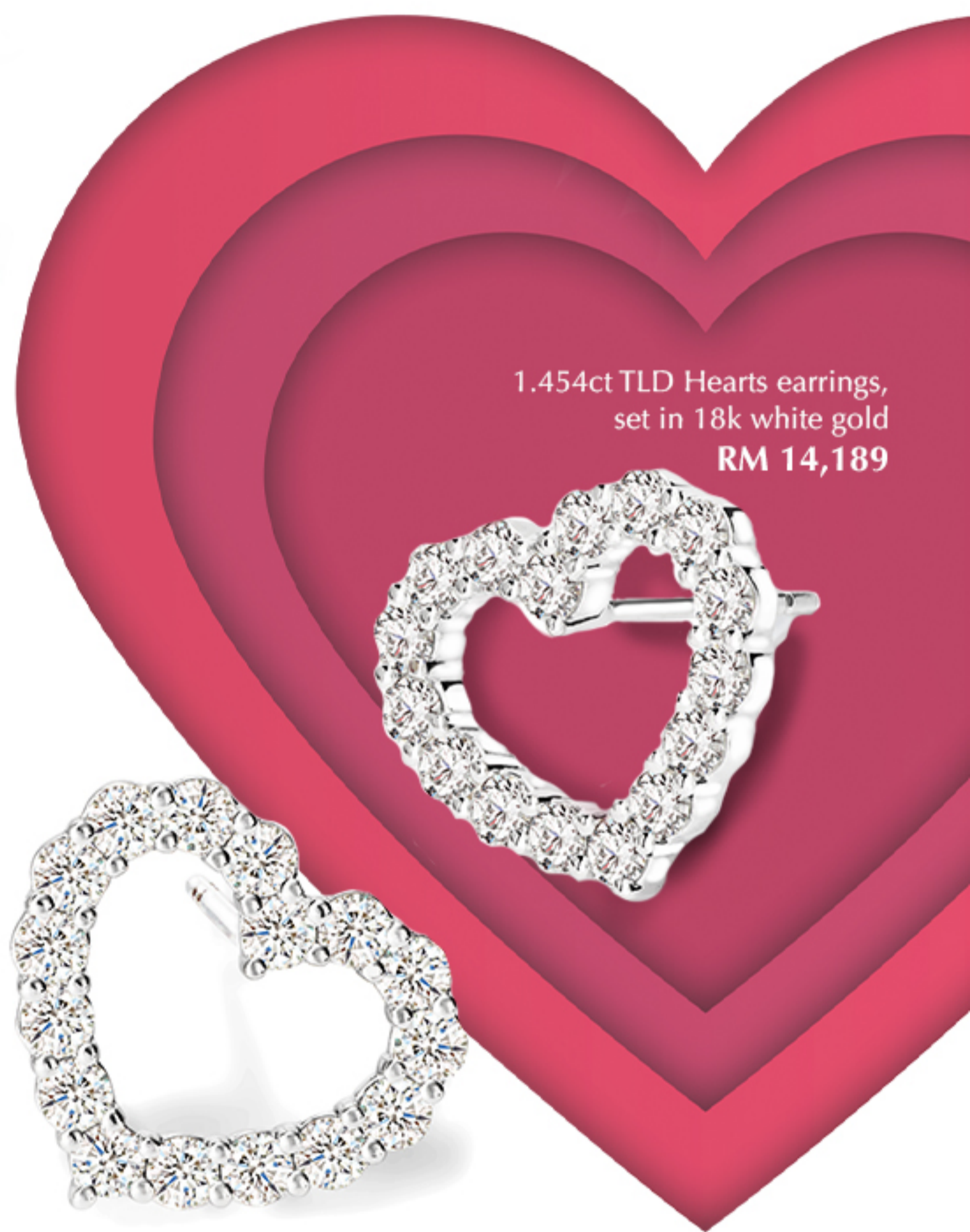
1.454ct TLD Hearts earrings, set in 18k white gold RM 14,189