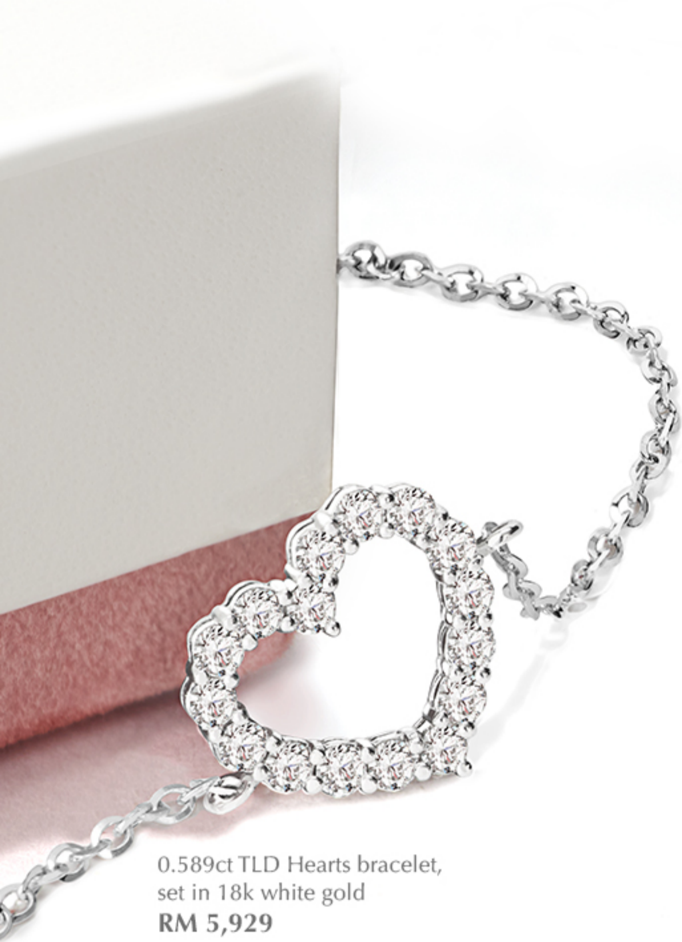
0.589ct TLD Hearts bracelet, set in 18k white gold RM 5,929